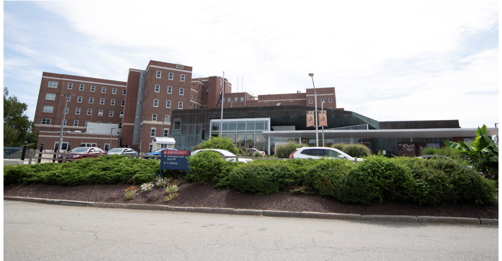
VA Providence Healthcare System

The VA Providence Healthcare System (VAPHS) provides Veterans residing in Rhode Island, southeastern Massachusetts and parts of eastern Connecticut with high-quality care across the full range of patient services and with state-of-the-art technology.