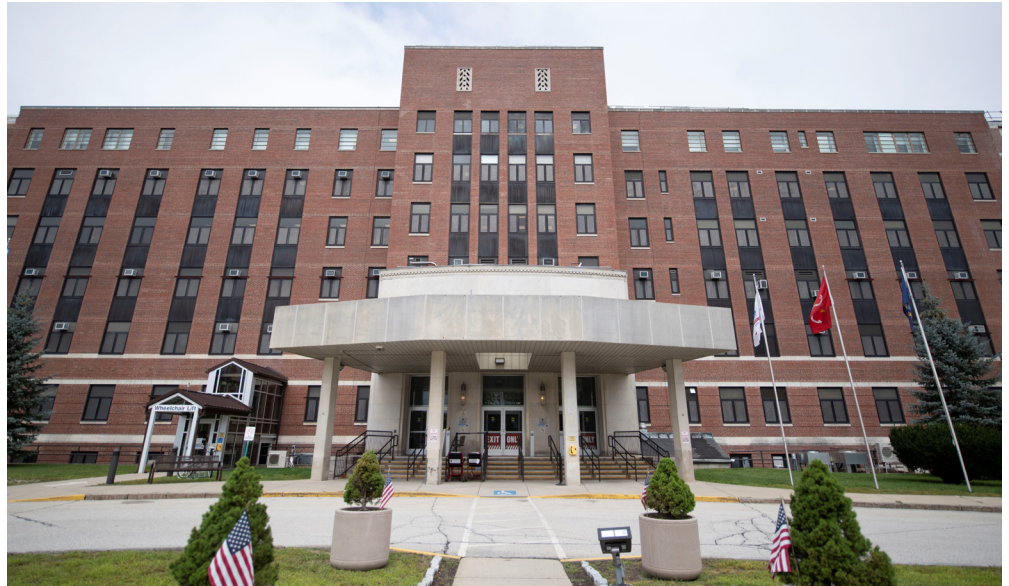
Manchester VA Medical Center

The Manchester Veterans Administration Hospital, now known as the Manchester VA Medical Center, was completed in 1950 as part of the post-World War II initiative of the Veterans Administration to provide modern medical care and facilities to Veterans of the war. To this day, we are committed to providing access to excellent health care for Veterans. That includes our main campus and the inclusion of four Community Based Outpatient Clinics in Conway, Portsmouth, Somersworth, and Tilton. We have health care services at the Brady Sullivan annex as well as telehealth opportunities that improve equitable access to health care benefits for all Veterans.