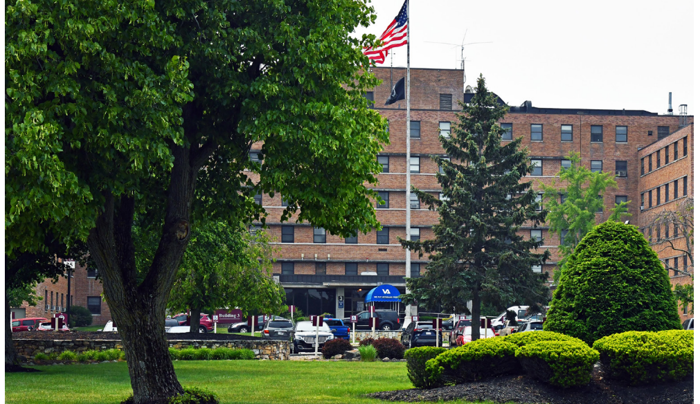
Brockton campus of the VA Boston Healthcare System

VA Boston Healthcare System consists of main campuses in Brockton, Jamaica Plain, and West Roxbury with VA clinics in Lowell, Quincy, Framingham, Plymouth, and Boston.