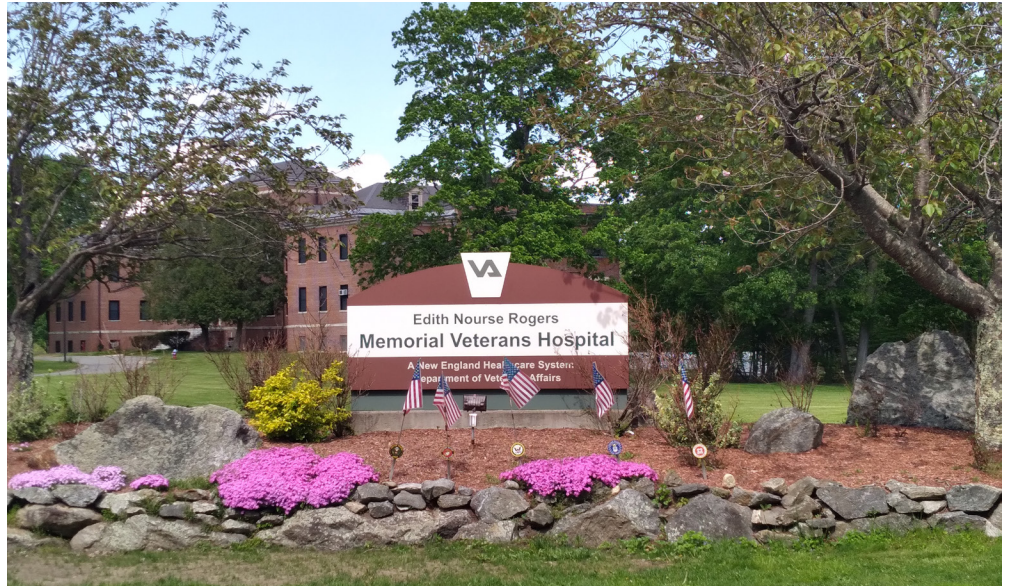
Edith Nourse Rogers Memorial Veterans' Hospital

Our mental health programs include vocational, peer, homeless and outpatient mental services, which are nationally recognized.