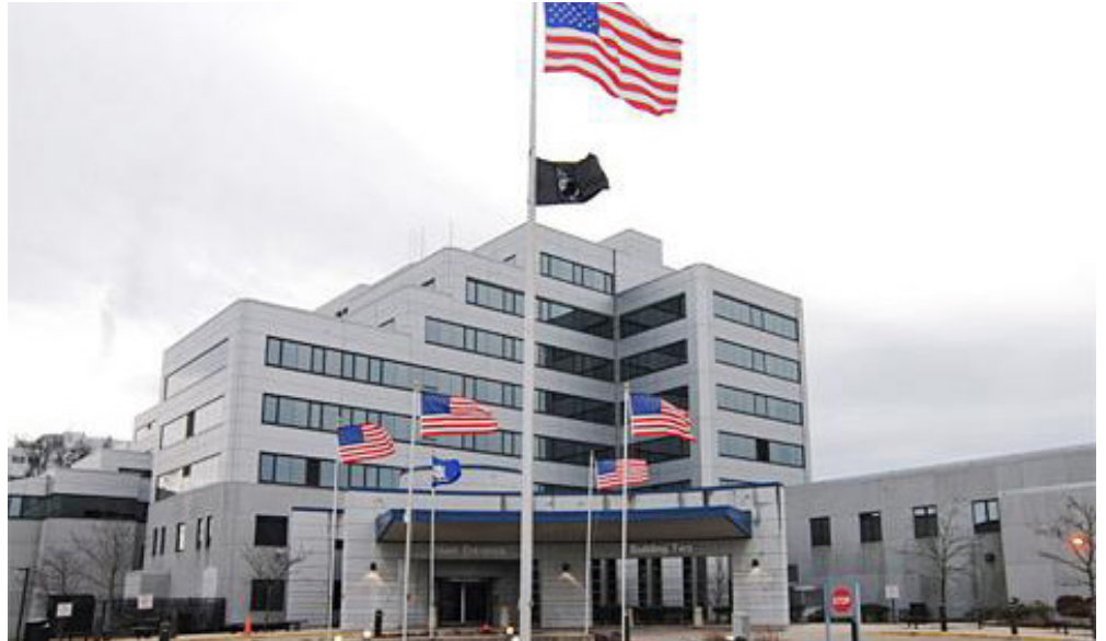
West Haven VA Medical Center

The VA Connecticut Healthcare System proudly serves Veterans in Connecticut and southern New England at 10 locations. VA Connecticut provides high-quality care, trains the next generation of medical providers, and conducts research to improve the lives of Veterans and all Americans through the use of discovery and innovative practices.