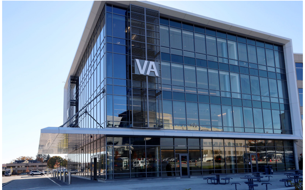
Worcester Community Based Outpatient Clinic

Veterans have access to healthcare services at eight locations, serving five counties in central and western Massachusetts. Facilities include our Edward P. Boland VA Medical Center in Leeds and seven Community Based Outpatient Clinics in Fitchburg, Greenfield, Pittsfield, Springfield, and Worcester. Edward P. Boland VA Medical Center opened in 1924 as the first neuropsychiatric hospital for Veterans in the United States. Named for Edward Patrick “Ed” Boland, he was born in Springfield and served in the Army during World War II. He represented the region in Congress for more than 30 years before retiring in 1989.