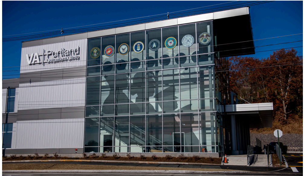
VA Portland Community Based Outpatient Clinic

VA Maine Healthcare System provides health care services to over 53,000 Veterans at 10 locations throughout Maine. Facilities include the Togus VA Medical Center in Augusta, seven Community Based Outpatient Clinics in Bangor, Calais, Caribou, Lewiston, Lincoln, Portland, and Rumford, and two Access Clinics in Fort Kent and Houlton.