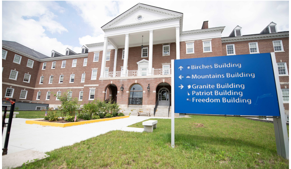
White River Junction VA Medical Center

The VA White River Junction Healthcare System (VAWRJ) provides outstanding health care, trains future health care providers, and conducts important medical research. VAWRJ provides health care services at eight locations in Vermont as well as northwestern New Hampshire.