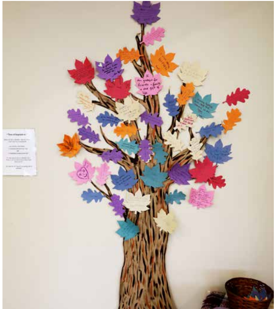
The Tree of Inspiration, where Veterans at the ECCC are invited to join the community by adding a leaf, contains something that motivates them or something they are grateful for.